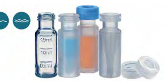
SureSTART vials and caps shown below are in 100 pack, but are also available in 5,000 and 10,000 pack options.

To assure no contamination or background corruption for PFAS analysis, we have more than one recommended closure. You are able to use one piece polypropylene snap ring caps or polypropylene 9 mm screw thread caps with a thinned penetration area. When resealing for multiple injections is important, we offer snap ring and screw thread caps with a silicone/polyimide septum for trouble free analysis.