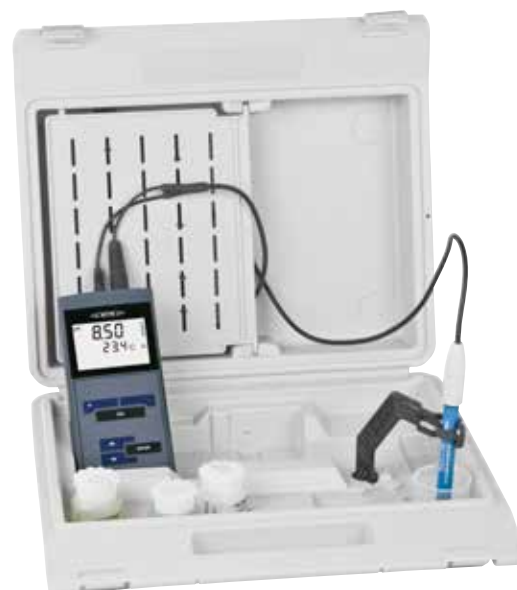
Set in case

The case also serves as a small field laboratory.