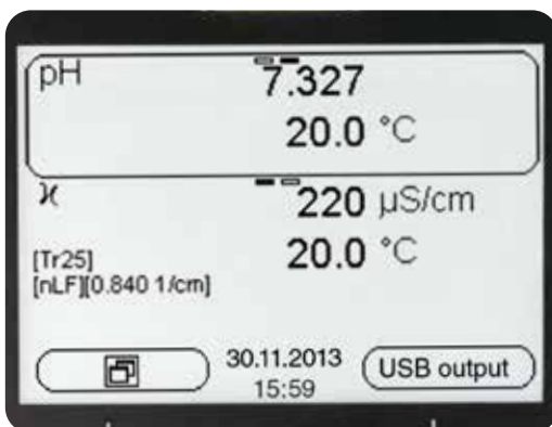
Display with two measured values