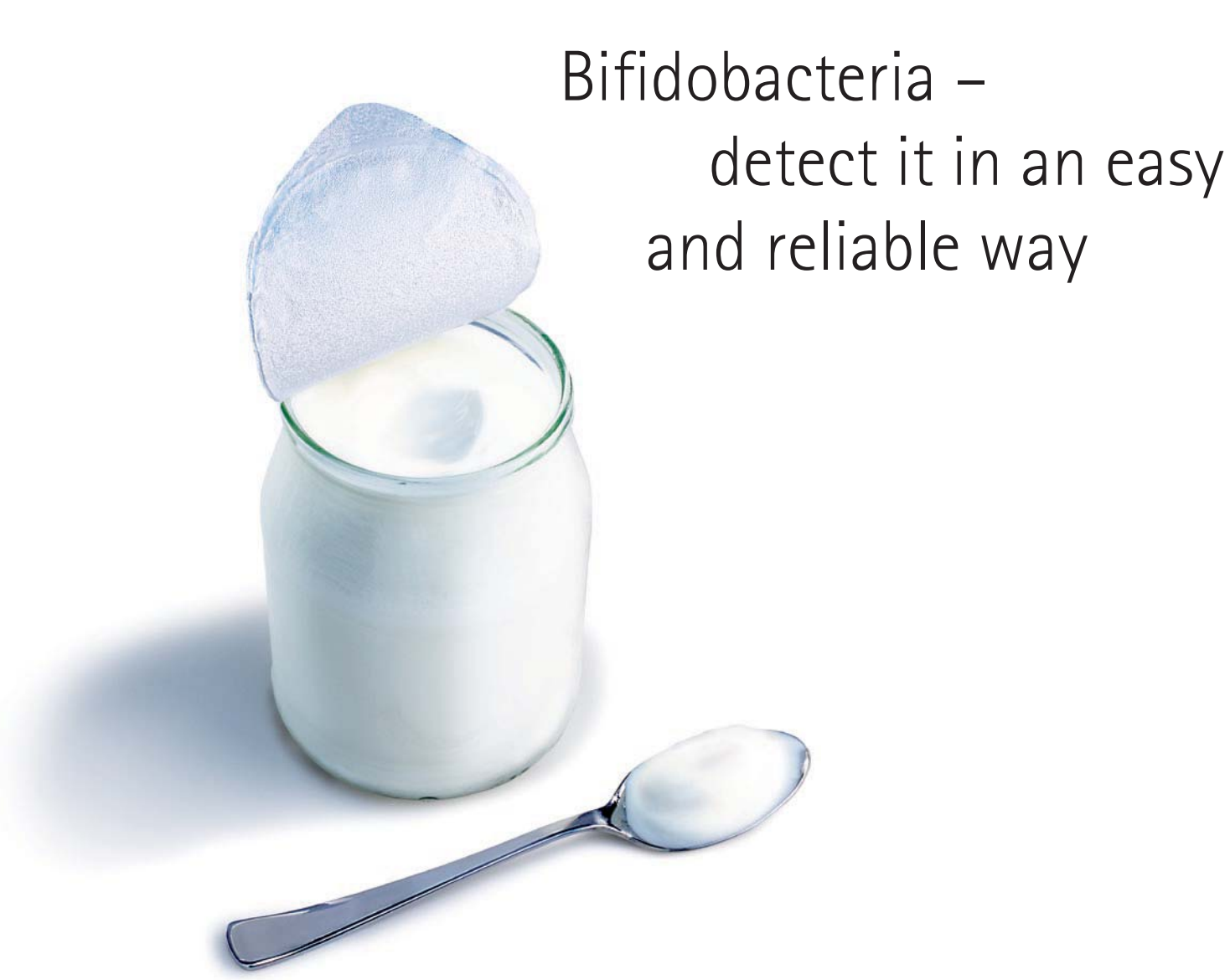
Partners for a better life

They are the first and last and are with you throughout your whole life. Bifidobacteria , also called probiotics – a natural part of the bacterial flora in the human body. But not only there, Bifidobacteria as well as other beneficial bacteria can also be found in fermented dairy foods, especially yogurt. Eating or drinking products rich in probiotics is a sort of home remedy for a lot of infections because it promotes the growth of these bacteria opposed to others.