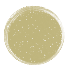
Bifidobacterium infantis ATCC 25962 on Clostridial Agar (RCM)

Superior inhibition of Lactobacilli due to Lithium–Mupirocin. Bifidobacteria will not be overgrown.