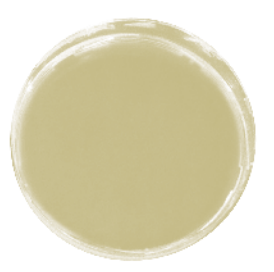
Lactobacillus delbrueckii ssp. bulgaricus ATCC 11842 on TOS-MUP Medium