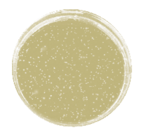
Bifidobacterium infantis ATCC 25962 on TOS-MUP Medium