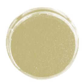
Lactobacillus delbrueckii ssp. bulgaricus ATCC 11842 on RCM

Detailed information about preparation, storage and / or experimental procedure and evaluation can be found in the technical data sheet on the internet: www.merck4food.com