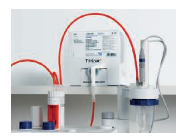
Precise analyses require precisely adjusted volumetric solutions. With Titripac® you can be sure that you've got a consistent solution up to the very last drop. A direct connection to the titrator via an adaptor makes lab work easier and helps to avoid contamination.