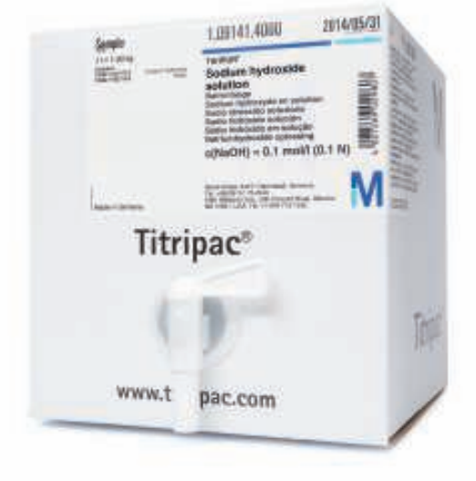
Titripac® is available in 4 liter and 10 liter sizes.