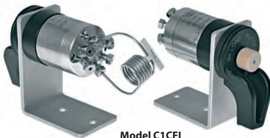
Model C1CFI 1/16" ZDV fittings