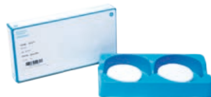
Fig 1. GF/C glass fiber filters meet the requirements of EN 872.